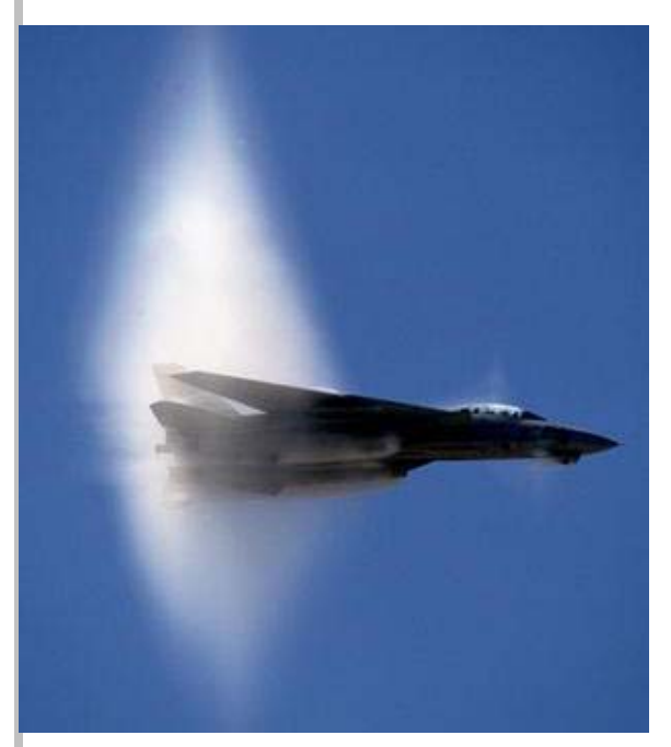
Breaking Through an Invisible Barrier -That Is Caused By The Speed Of Sound, Cost Many Lives Even Though It Could Not Be Seen Or Felt Until 760MPH Was Achieved.

Too often, managers focus solely on the probability of a risk or problem happening and ignore far more important factors such as the cost of failure and the ability to actively manage each risk, as more is learned. To properly manage a business, risks must be evaluated and monitored constantly. Steps can usually be taken to adjust the three main