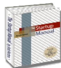
ALL FOURS BOOKS

The Startup Manual includes all four books plus our proprietary business design tools CD-ROM.